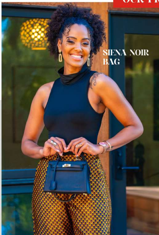
SIENA NOIR BAG