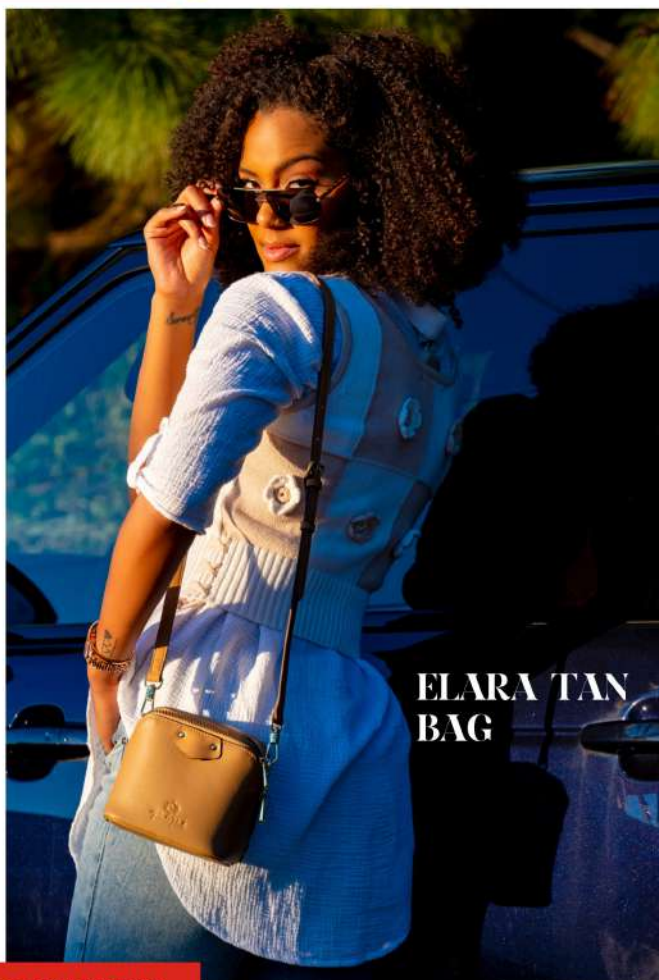
ELARA TAN BAG