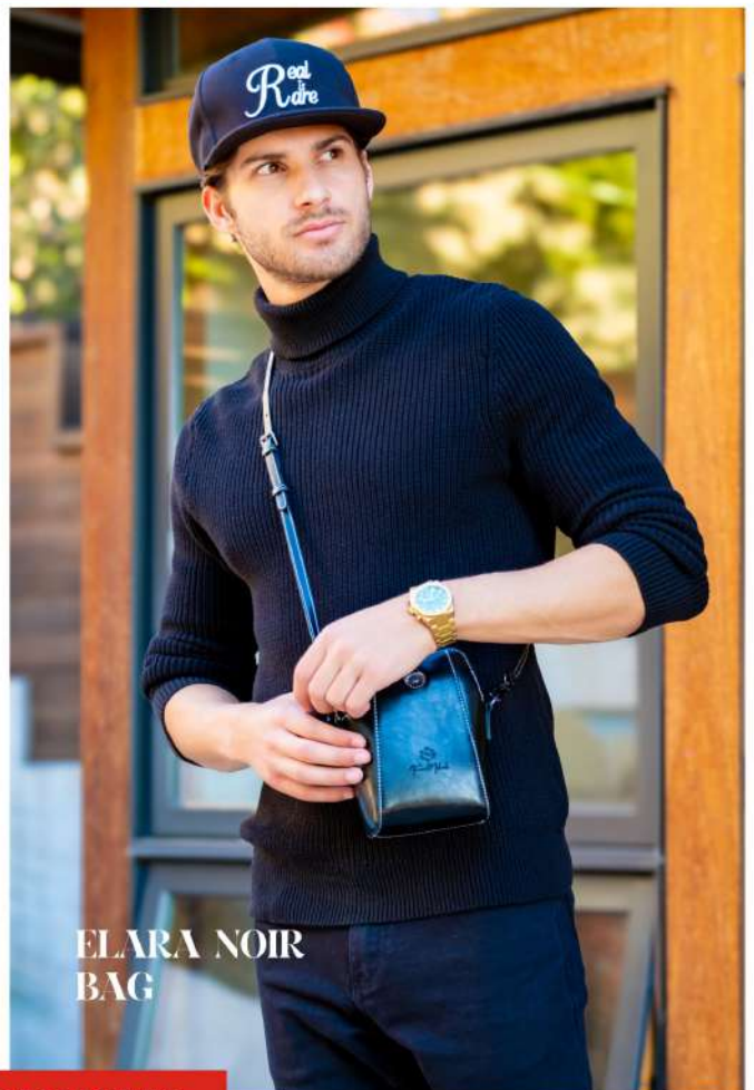
ELARA NOIR BAG